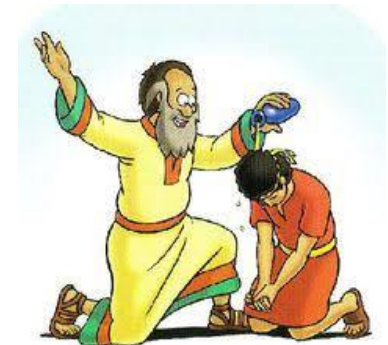
the anointing of David

Associate Rector in the Wychert Vale Benefice Phone 01296 748 390